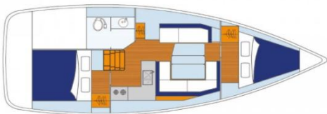
38 / 2 Cabin 1 Head