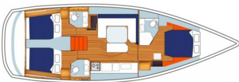
47 / 3 Cabin 3 Head